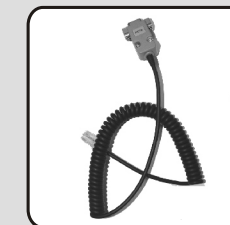
Transmitter programming cable PL-R50E2