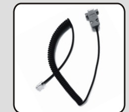
Receiver programming cable PL-R50E3